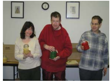
The Bring To Light Candle team